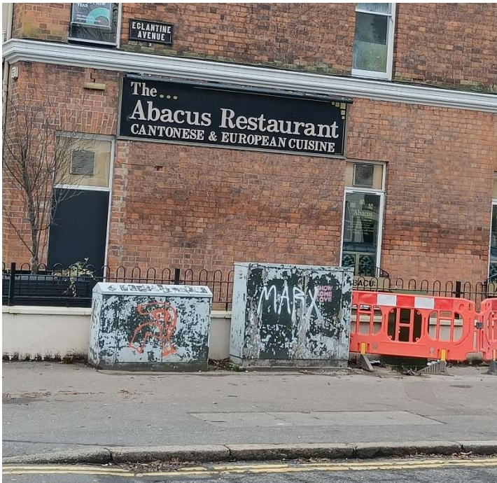
Don't be misled by the outside

2. Abacus - A great Chinese restaurant – reasonably priced – does all the standard stuff.